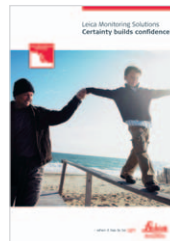
Leica Monitoring Solutions Product brochure