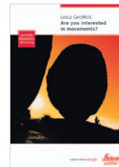
Software Leica GeoMoS Leica GeoMoS HiSpeed Leica GeoMoS Web