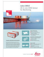
GPS/GNSS Leica GM10 Leica GMX902 Series